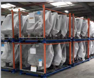
Environmental and Logistics Savings